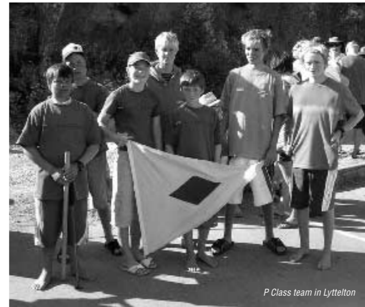
P Class team in Lyttelton