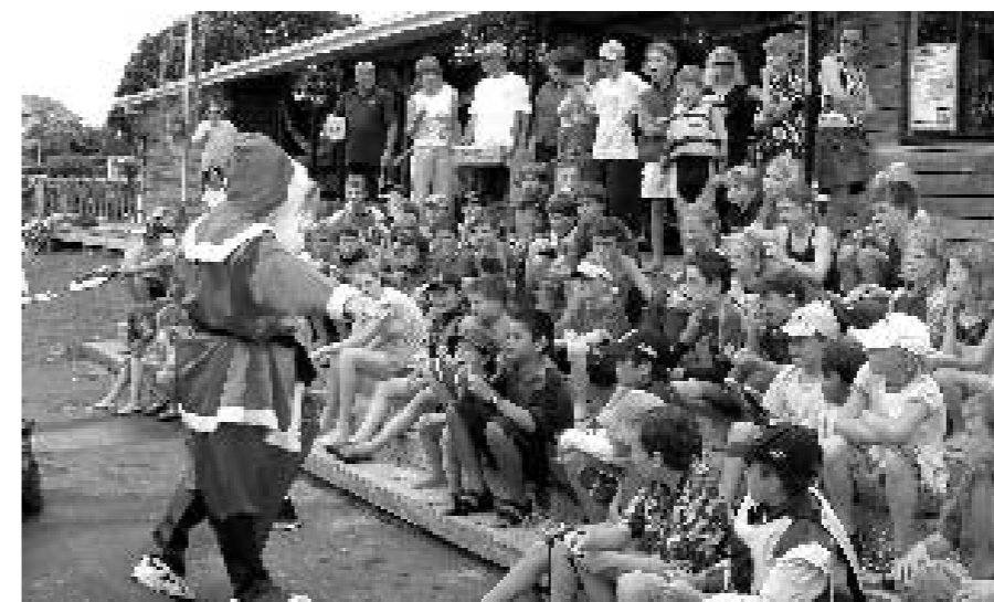
Santa at the Christmas party

Perhaps we could put together a Wakatere team next year. If you are interested, have a chat to one of them.